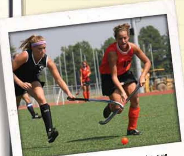
Nearly 25% of Hendrix students are active in intercollegiate sports.

Definitely. Students are unlikely to choose a challenging, small, private college if all they want from their education is a degree. We are considered a selective college, not only because we select students of high academic ability but also because we select students who have a passion for learning and a curiosity about many subjects and topics.