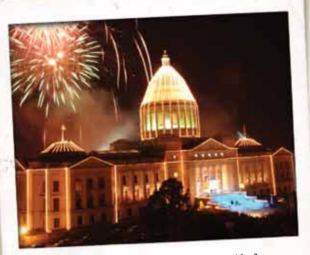
Little Rock, the state capital, is just 30 minutes down the road.