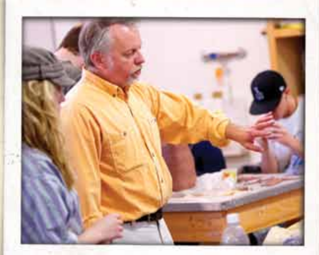
An average class size of 18 means that professors can give each student individual attention.

No! You'll find support for your efforts nearly everywhere you look at Hendrix. Our small class sizes and student-to-faculty ratio of 12:1 facilitate close working relationships with faculty that ensure you will achieve at your highest level. Support, however, does not mean "holding your hand." It means your professors encourage you to take some risks, explore new areas, and pursue adventures that you might never have considered.