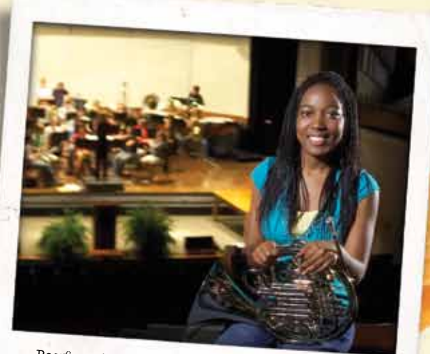
Performing in concerts, recitals, and plays is one of countless ways students can earn Odyssey credit.

"Hendrix educates. Hendrix exposes. And that's what I love - the exposure, the ideas, the people who bring them all together."